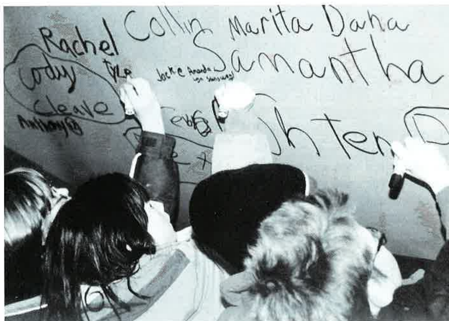
Athol Elementary School students signing the LSV-2 before the christening ceremony.