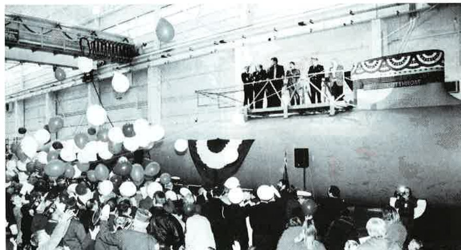
Immediately following the christening, 1200 balloons were released.